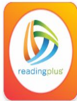
Reading Plus ⓘ